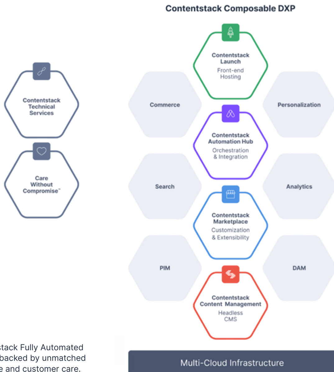
Figure 1. Contentstack Fully Automated Composable DXP backed by unmatched technical expertise and customer care.

At Contentstack, we make going composable easy at any scale. It's a promise unmet by headless CMS vendors alone, and a promise unfulfilled by legacy DXP vendors. We accelerate the adoption of composable digital architectures through our industry-leading technology, dedicated expertise and care, and proven economics. Under the hood, you'll find every customer implementation is unique. We are here to ensure that you can make the Contentstack platform truly your own, unique to your business needs.